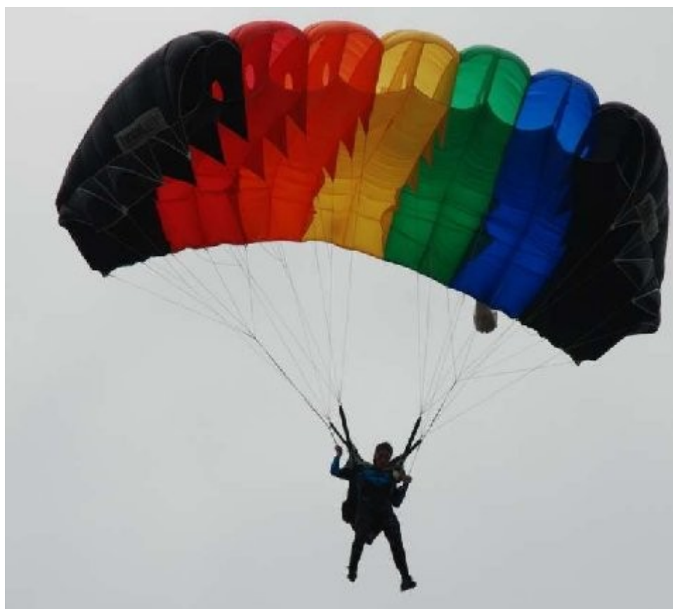
Accuracy landing with a Parafoil