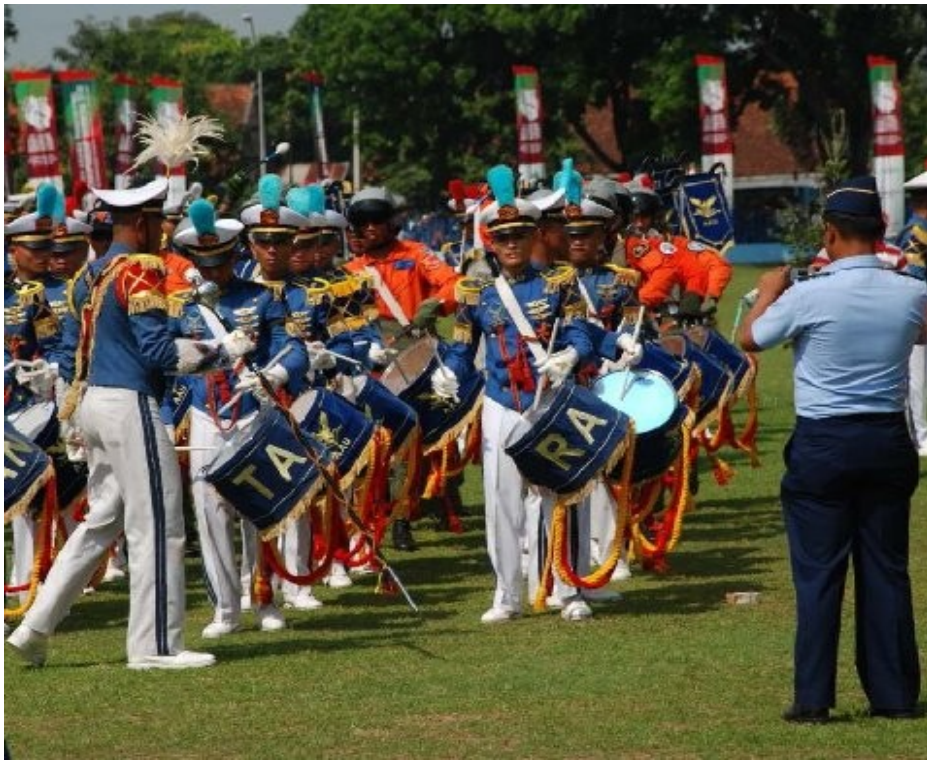
Soemarmo AF band playing at the opening ceremony. This was followed by a march on the jumping ground with the different nations parading in front of the local authorities and the organizing committee