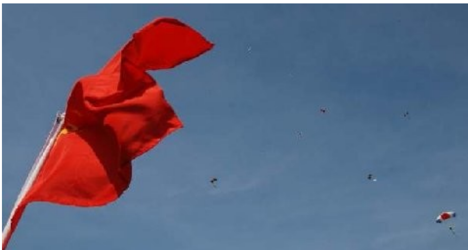
The China team flag with skydivers in the air