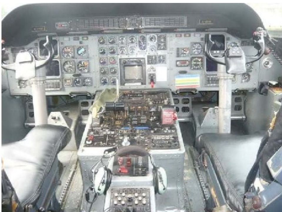
A close view of one of the cockpits