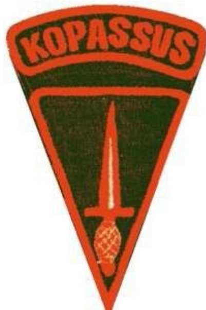
Kommando Pasukan Khussus (Kopassus Special Forces)