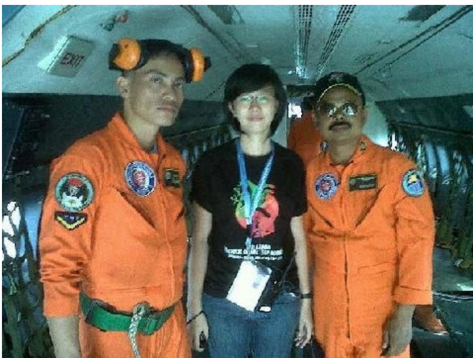
The local interpreter inside the Casa 32 with one of the pilots and the dispatcher