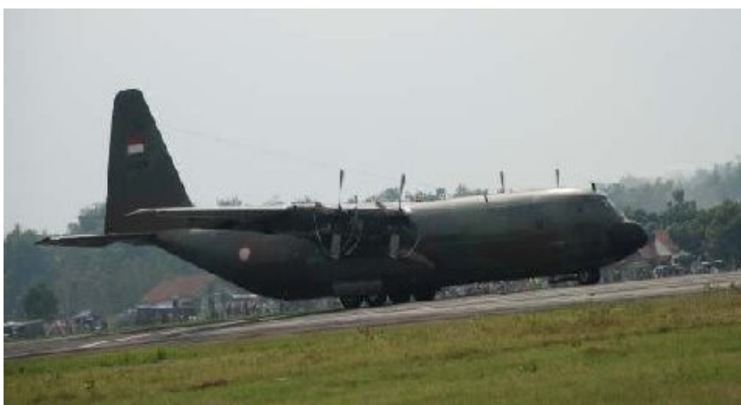
C130 on the runway