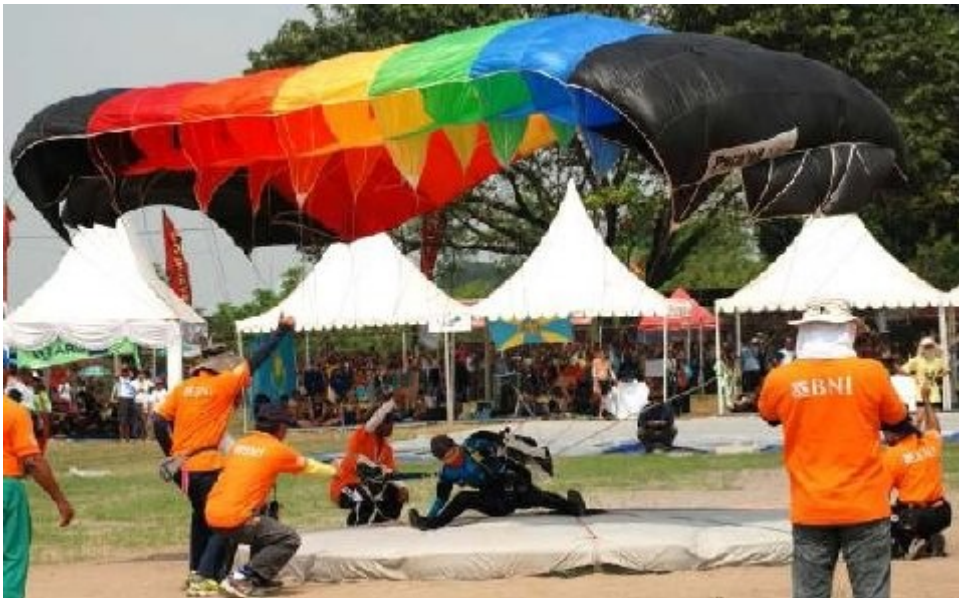
Accuracy landing from one of the China team mates