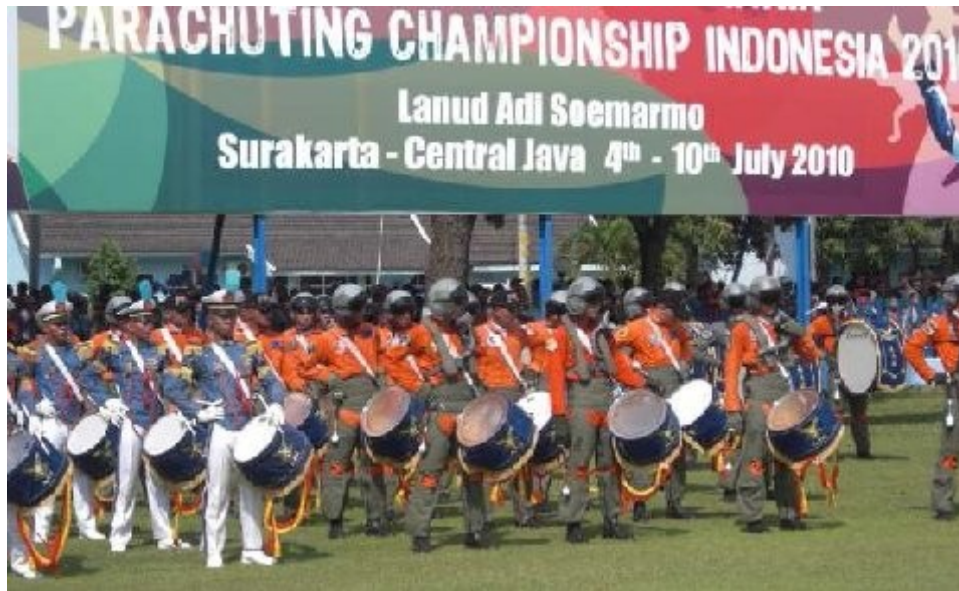
Indonesian Soemarmo Air Force base marching band at the opening ceremony of the parachuting event