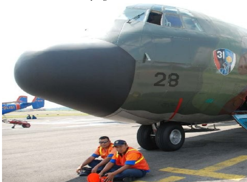
Waiting for the next lift