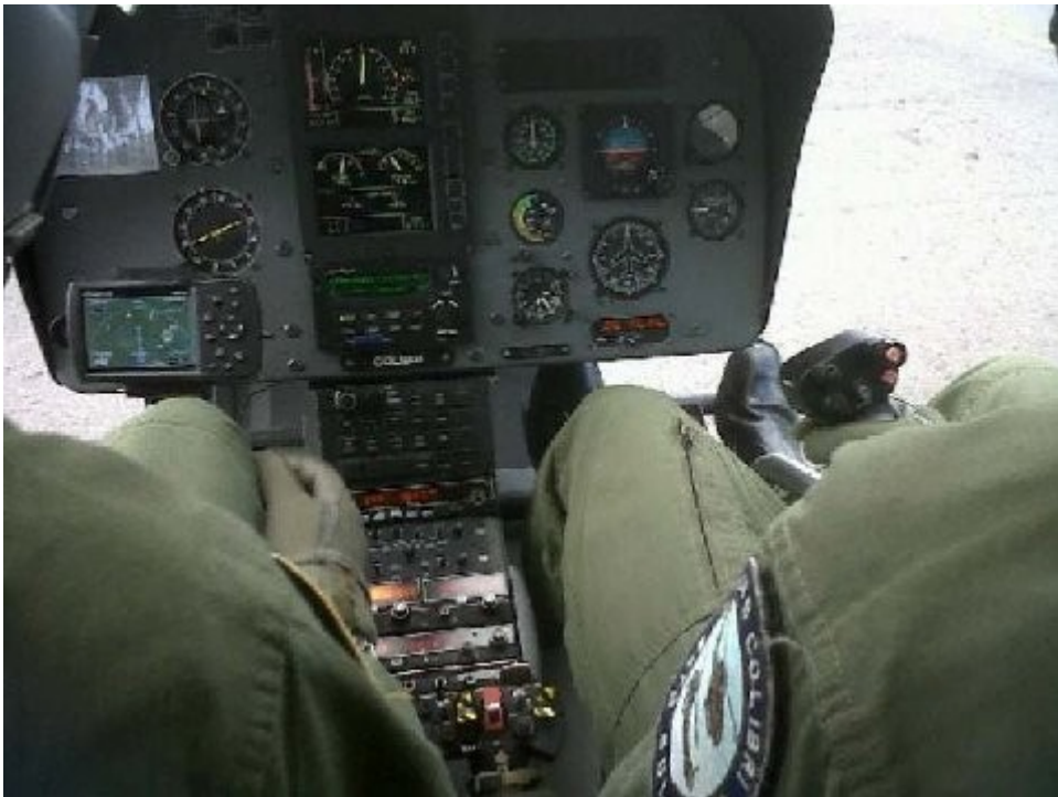
View from a Eurocopter cockpit flying over the DZ- (Colibri)