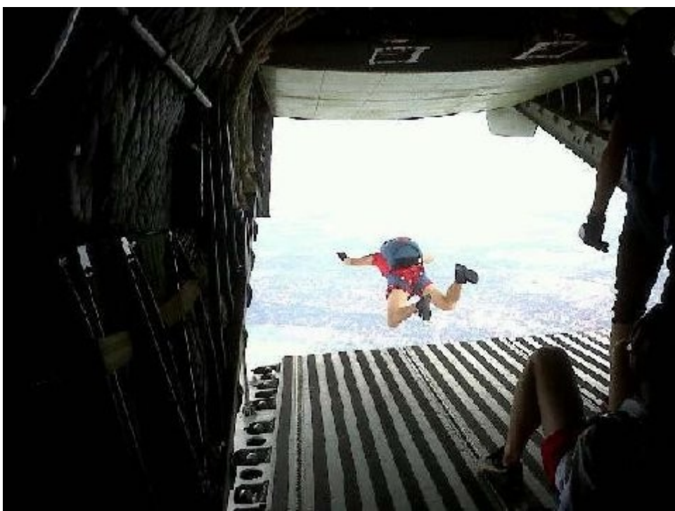
A ramp free fall exit