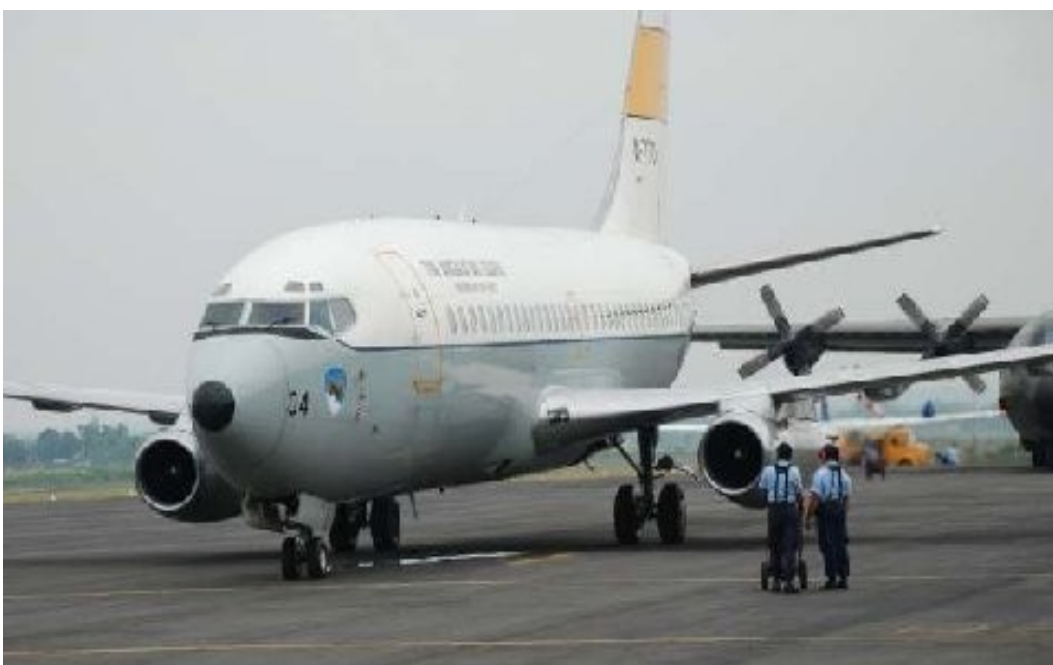
Suemarmo AF base