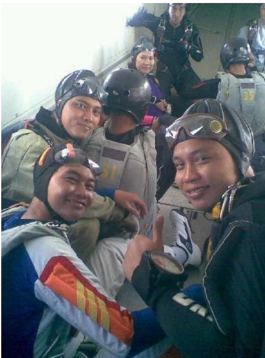
Indonesian elements (note the MC rig on some of the jumpers)