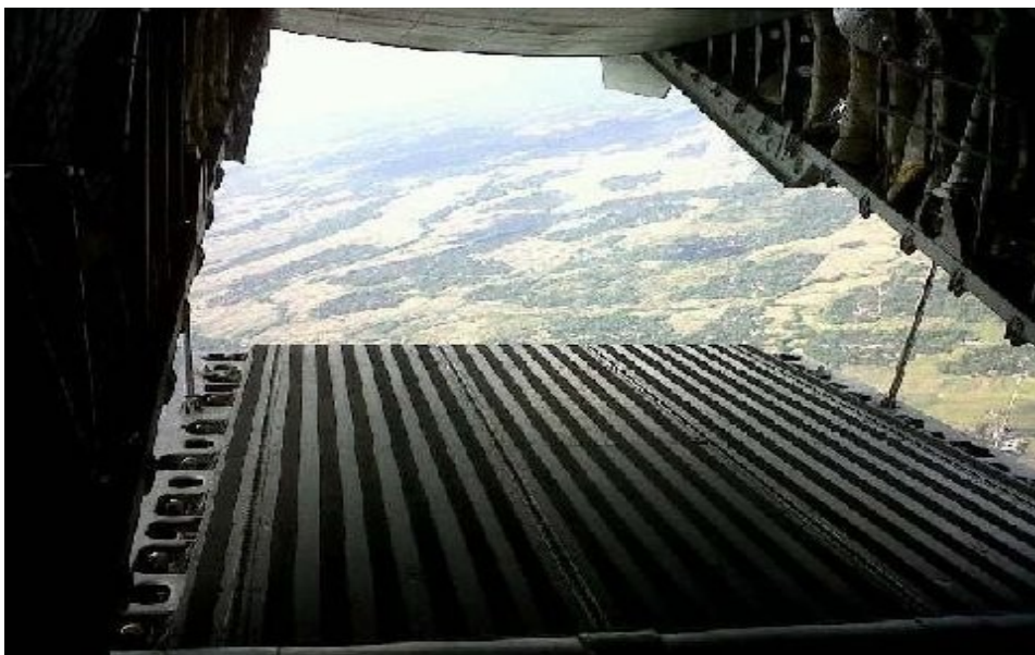
View of solo from the ramp