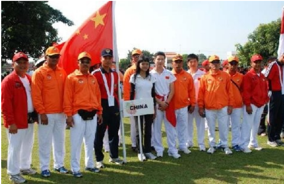
China and Indonesia teams