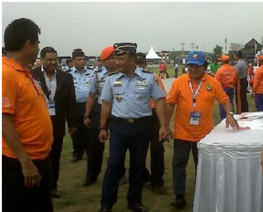
The Air Force top brass and the the Kopassus commander at the opening ceremony at Soemarmo Air Force base greeting the China team

The event on the island of Solo started on a hot day under the auspices of the Indonesian authorities. It was a long and tiring trip from both Guangzhou in Guangdong province and Hong Kong with a night in Jakarta followed by a grilling 10 days with daily jumps except for a day of interruption due to rain. The atmosphere was friendly and provided a good opportunity to network with elements of the Indonesian jumping community among others. The China team ended the trip with 10 titles among which were 3 gold medals. Some of the pictures below to give you the feel of the jumps at Solo.