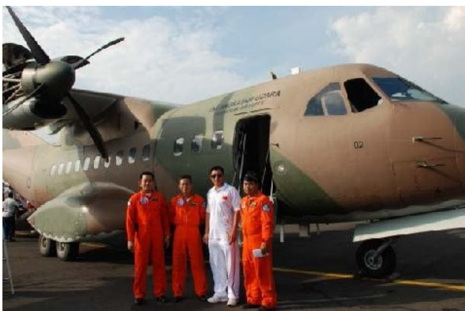
Some of the flying staff at Soemarmo AF base