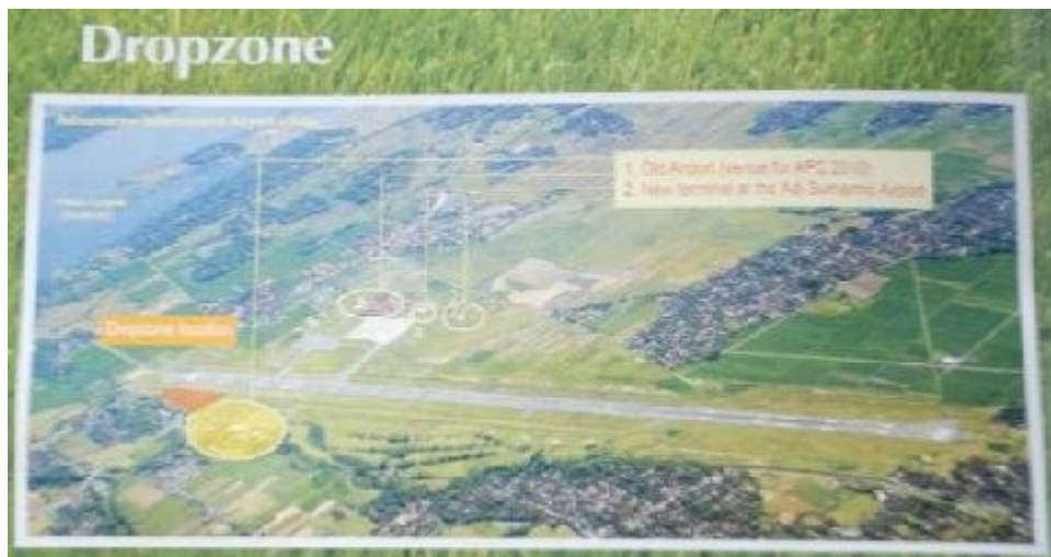
Drop zone in central Java

Among the Governing Board and the Board of Directors were :- Coordinating Minister for political, legal & Security Affairs- Defense Minister- Chief of Staff, The Indonesian Air Force- General Commissioner of the Indonesian Police- General Commander Kopassus, Indonesian Army- Corps Commander of Special Force, Indonesian Air Force- Corps Commander of Mariner, Indonesian Navy- Corps Commander of Mobile Brigade, Indonesian Police