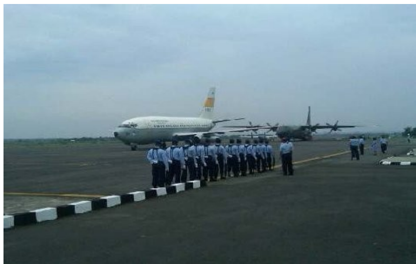
Honor guard at Soemarmo AF base awaiting for the military top brass to attend the opening ceremony