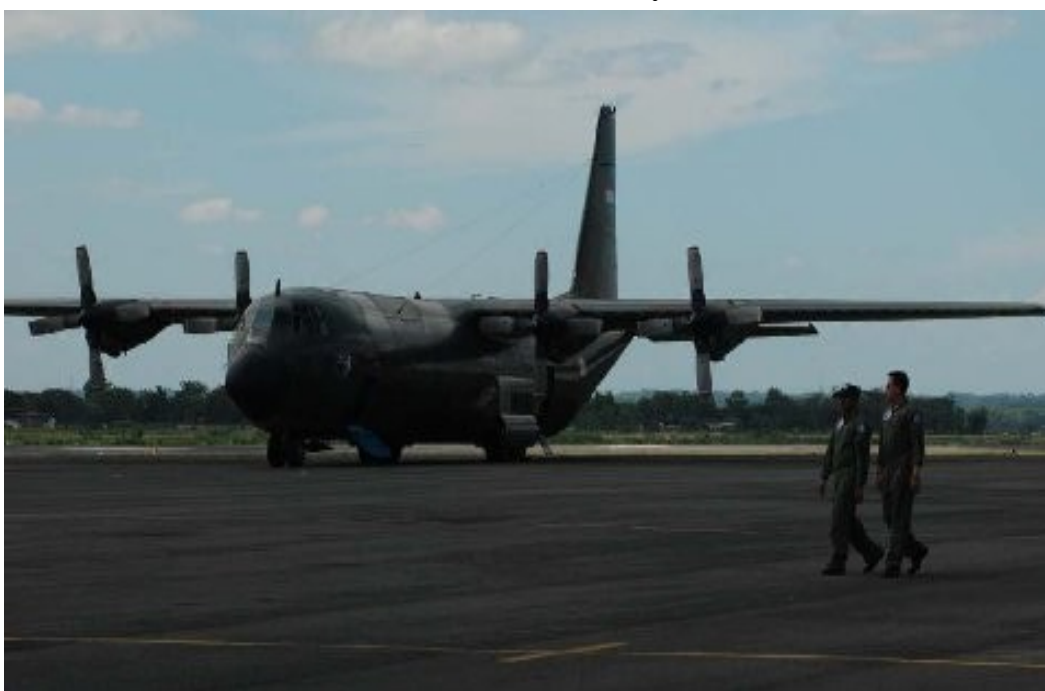
Another view of the C130